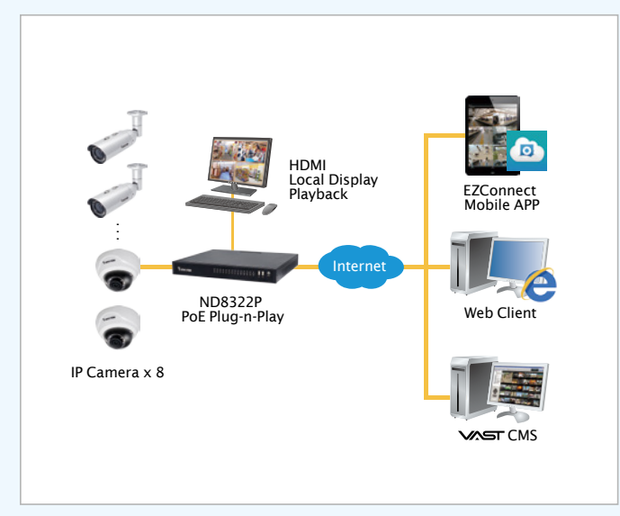
ND8322P Application Scenario